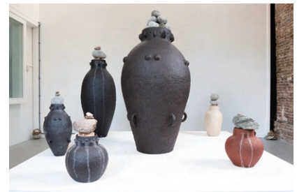
“Jars” 2023-2024 Ceramic, wood, stone, vegetable, salt