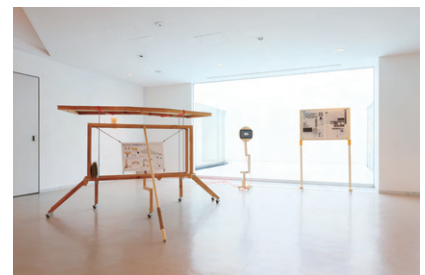
"Flip the paper near the chin" 2023 Wood, newspaper, band

Born 1998 in Tokushima and lives in Okinawa, Japan. Graduated from Kanazawa College of Art in 2024 with a major in sculpture. She creates works based on the theme of finding out a pattern from trivial gestures in the everyday. In 2021, she launched a handwritten newspaper "Poyopoyo Newspaper" and writes monthly! Her favorite foods are cream puffs and azuki beans. https://www.instagram.com/conbu13den/