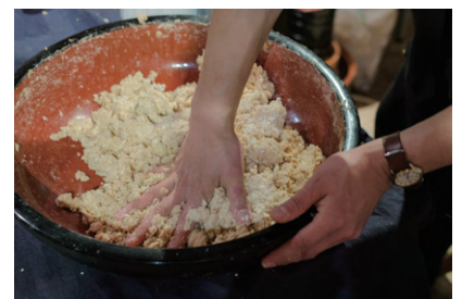
“Making Miso Paste” 2024 Live music, DJ and artists, soybeans, koji, salt