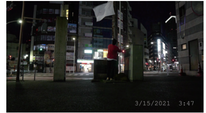
"Missing Sun" 2021 Single-channel video 14 min. 3 sec.

Born in Yamaguchi Prefecture in 1983. After graduating from university, he worked in architectural design for several years. He has been showing his work in exhibitions since 2014, and now he is working on the theme of new ways to use the city. He has been running TOMO City Museum since 2020, and proposes proactive engagement with the city through workshops. https://tomotosi.com/