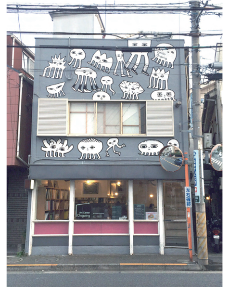
Art Center Ongoing

Incorporated Association Ongoing operates Art Center NEW in Yokohama and also runs Art Center Ongoing which is an art space located in Kichijoji, Tokyo, and has been organizing various exhibitions and art events related to contemporary art for more than 15 years. We have organized more than 400 exhibitions and formed a network of more than several hundred artists, both young and established, from Japan and abroad. With this wealth of experience and relationships, we will continue to develop a variety of projects for Art Center NEW.