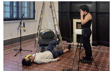
"Bruce and Blues" 2024 Stepladder, flat pan, cart, microphone, microphone stand, amplifier, projector, Cantonese rice wine, dragon ornament, rice, envelopes, etc.

Born 1976 in Shiga Prefecture. Graduated from Musashino Art University, Faculty of Art and Design, Department of Scenography. In the name of "non-productive production activities," he takes as the starting point of his production a response to the inconsequential things and mere thoughts of everyday life. He has been developing his work regardless of media, such as installation, video, web, and performance. https://www.workth.net/