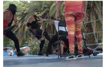
"Musical chairs" 2018 Performance, Video 7 min 46 sec, Sound, HD

Born 1987 in Aichi, Japan. Completed a diploma in Stuttgart State Academy of Fine Arts and Music in 2017. He creates sculptures, performances, and video works that reflect his daily life, incorporating the characteristics of the country or region in which he lives. In recent years, he has been practicing the project of "creating a physical movement like a sport," for approaching the relationship between the plasticity of rules and locality. http://gakunakano.com/